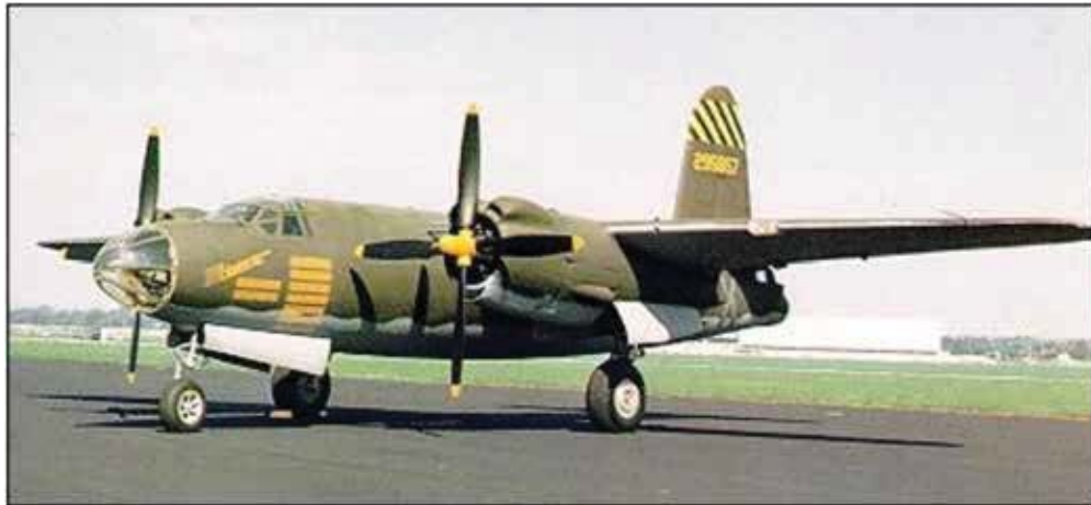
Figure A-2 B-26 Marauder Similar to "Times A Wastin"