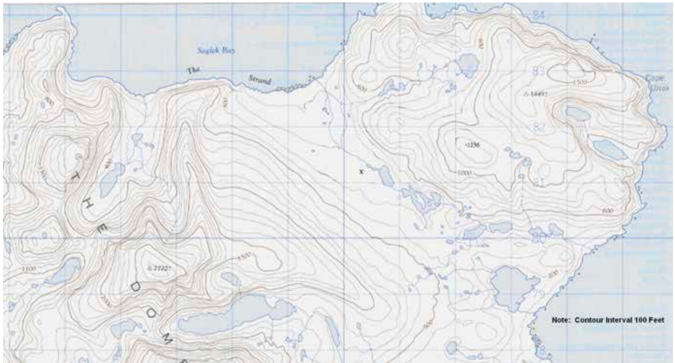
Figure A-5 Crash Site Marked With an "X"

Note. Created by Director Cadets 3, 2010, Ottawa, ON: Department of Defence.