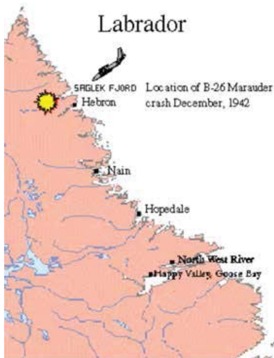
Figure A-4 Crash Site

The weather turned sour and the pilot was forced to crash land at the head of the Saglek Fjord in Labrador. The aircraft sustained minimal damage and the crew survived the impact unscathed. What follows is their efforts to survive in one of the most unfriendly and hostile landscapes on Earth at the worst possible time of year. The diary of the pilot has been retained intact; the last entry added was in February 1943. Except for names and places, spelling and punctuation have been retained as they appeared.